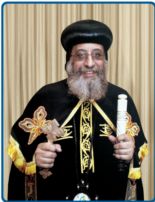
H.H. Pope Tawadros II Pope of Alexandria & Patriarch of the See of St. Mark